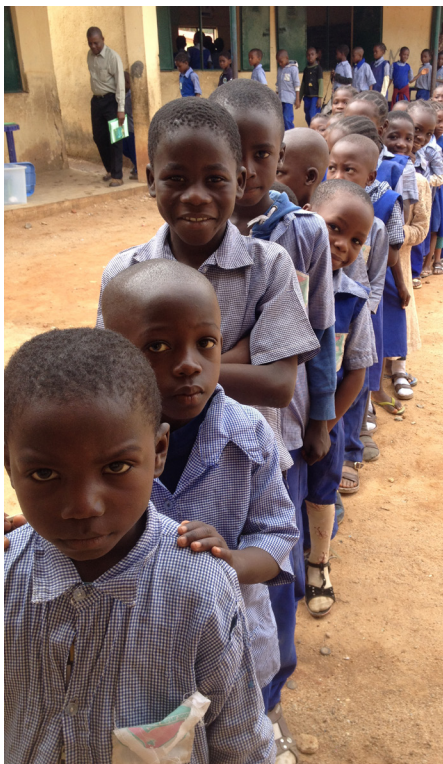
Schoolchildren in central Nigeria line up for a blood test. The results later verified that the parasite that causes lymphatic filariasis was not present.

A nongovernmental organization, The Carter Center has helped to improve life for people in more than 80 countries by resolving conflicts, advancing human rights, preventing diseases, and improving mental health care.