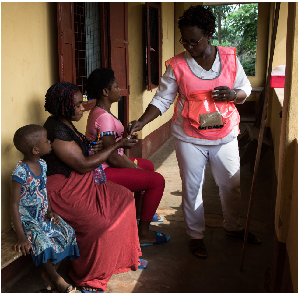
In Nigeria's southern Imo state, a community drug distributor administers preventive treatment for lymphatic filariasis.

Globally, about 120 million people are infected with lymphatic filariasis, and nearly 900 million are at risk. The Carter Center works in Nigeria, Ethiopia, and on the island of Hispaniola, shared by Haiti and the Dominican Republic.